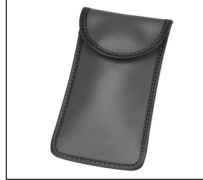
Carrying case : 93033