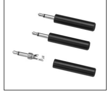
Output Plug : 98012