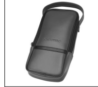
Carrying case : 93034