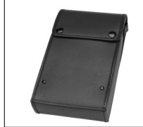
Carrying case : 93030