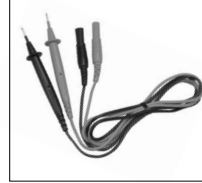
Test lead : 98011