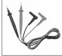
Test lead : 98010