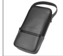
Carrying case : 93031