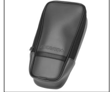
Carrying case : 93032