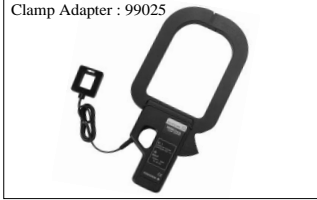
Clamp Adapter : 99025